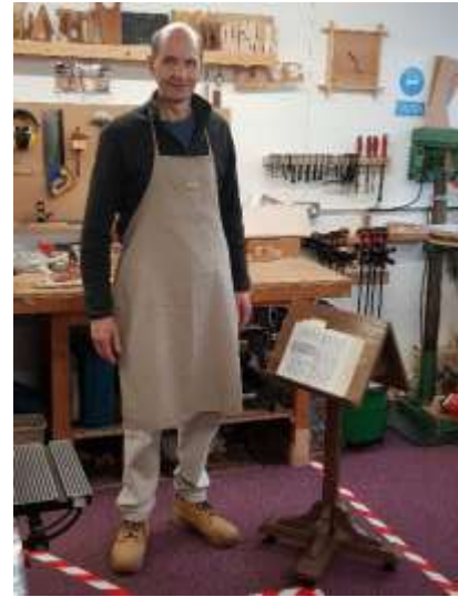
Above: Oak book stand with revolving top - a very satisfying result!